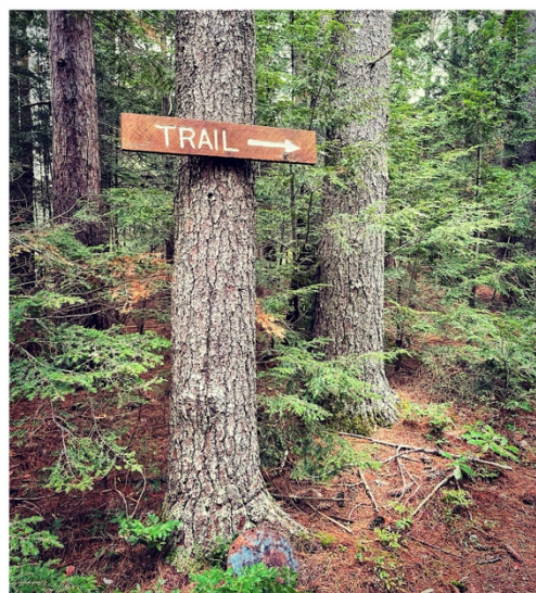
Two Rivers Trail