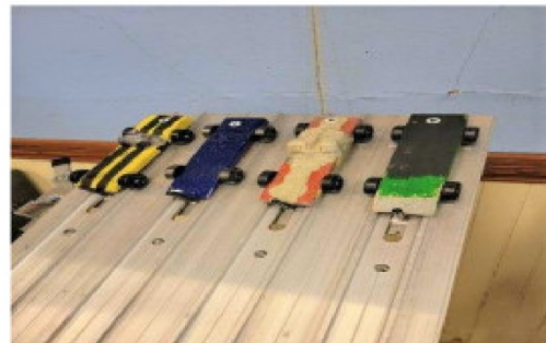
Bear B, Webelos and AOL's Cars