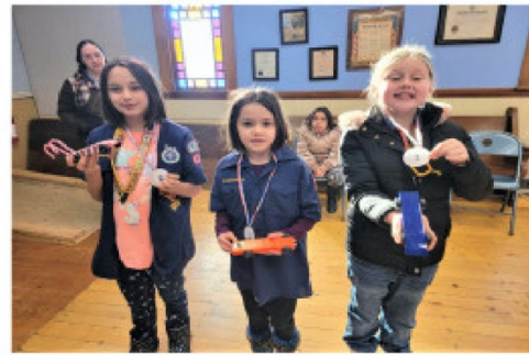
Bears G Den