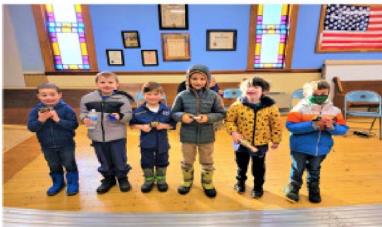
Tigers Den and Cars

Remember the Pinewood Derby? Our scouts still have it! Here are some pictures from last month. A few Scouts are wearing their awards, but all were winners with their individual race cars. (Each group raced individually this year due to Covid.)