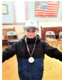
Bear B Den