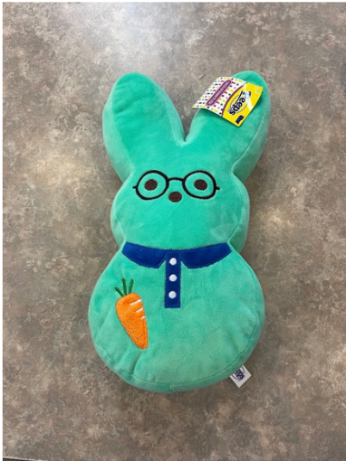
Age 5 and under

Stop by the library the first week of April and cast a vote for your favorite Peeps Diorama! Winners will take home one of these great prizes: