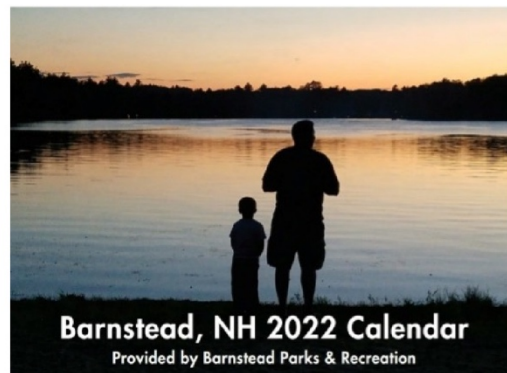
Barnstead, NH 2022 Calendar Provided by Barnstead Parks & Recreation

If you are interested in joining this wonderful adventure feel free to reach out. You can email us at friends.bpnr@gmail.com . We will be electing a board in the near future and would like to get good community involvement.