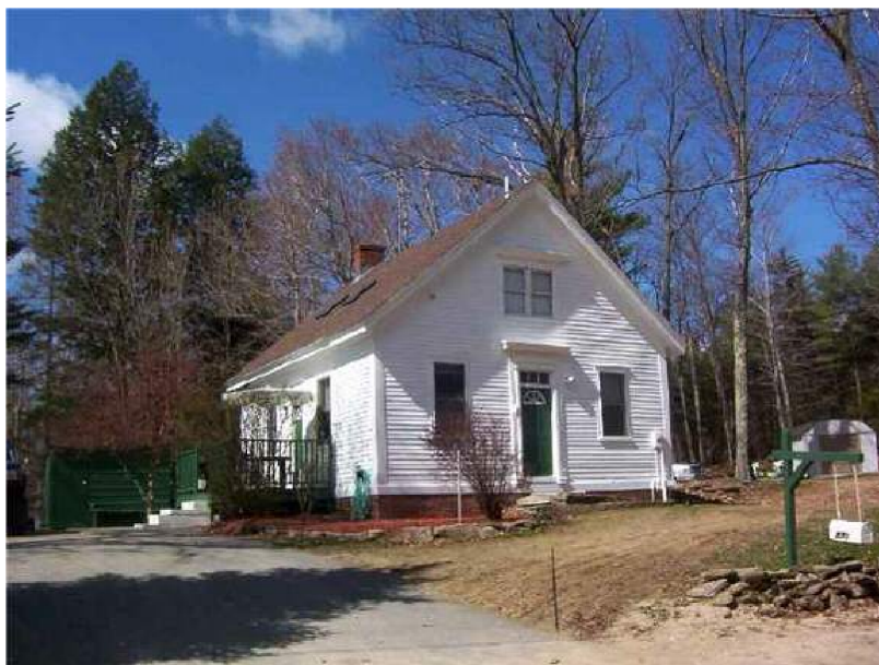
North Barnstead Schoolhouse

A ceremony opening the new elementary school was held on August 24, 1958. A handful of these original schoolhouses remain in use as private residences.