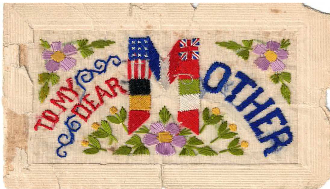
Happy Mother's Day! - card circa WWI